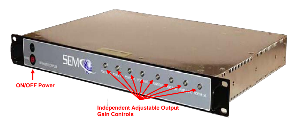
Figure 3-1 RF Multi-Coupler Front Panel Controls

As shown in Figure 3-1, the MC110 Front Panel is divided into two sub-panels: