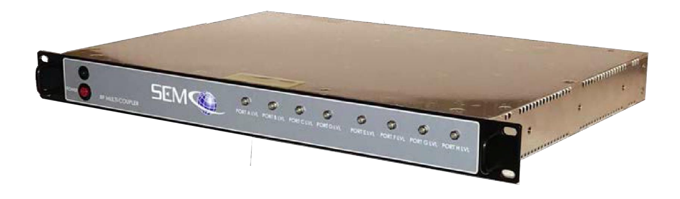
Figure 1-1 MC110 Series RF Multi-Coupler

Section 4, RF Multi-Coupler Operation provides instructions for MC110 operation.